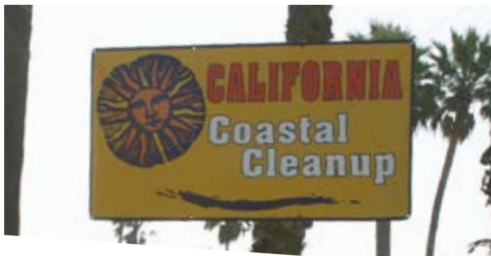
The California Coastal Cleanup taking place across the state is the State's largest volunteer event.

Every year, on the third Saturday in September, people join together at sites all over California to take part in the State's largest volunteer event, California Coastal Cleanup Day. In 2015, nearly 68,000 volunteers removed more than 1,143,000 pounds of trash and recyclables from California's beaches, lakes, and waterways. Families, friends, coworkers, scout troops, school groups, service clubs, and individuals come together to celebrate and share their appreciation of California's fabulous coast and waterways. The event is part of the International Coastal Cleanup, organized by the Ocean Conservancy, which is the largest volunteer event on the planet!