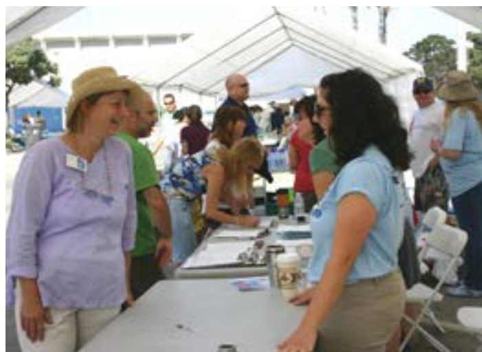
Volunteer check-in and information at the event