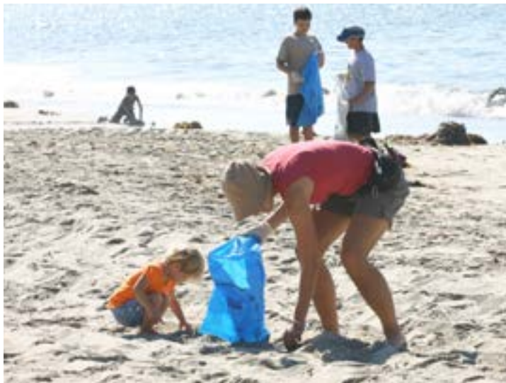
80% of trash in the ocean is due to land-based sources.

continued from page 5 means hazards for animals and humans. Marine debris affects at least 663 species worldwide, including all known sea turtle species and about half of all of marine mammal species. More than 80% of these impacts were associated with plastic debris.