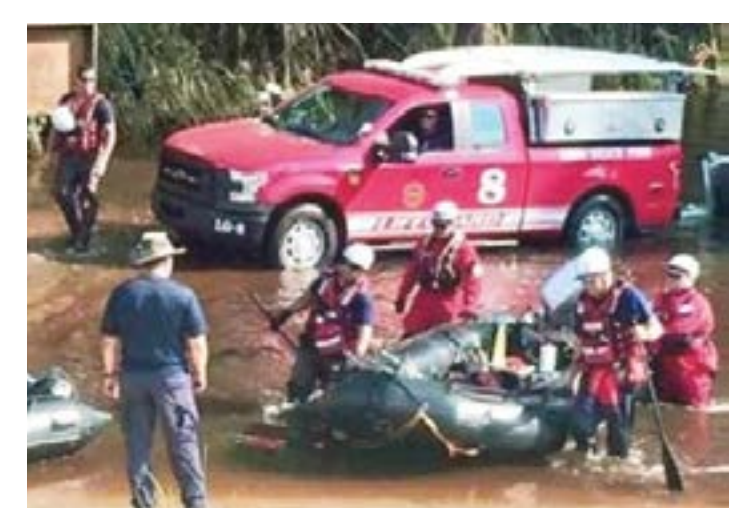
Long Beach Marine Bureau Swiftwater Rescue Team and The Long Beach Urban Search and Rescue Team assist in the relief effort in Texas after Hurricane Harvey.

The Fire Department/Marine Safety Division is committed to providing the highest level of service to our community and most recently, in College Station, Texas. Yes, that is correct.