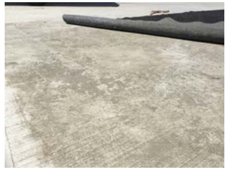
Mats can damage the new docks as seen in this photo.