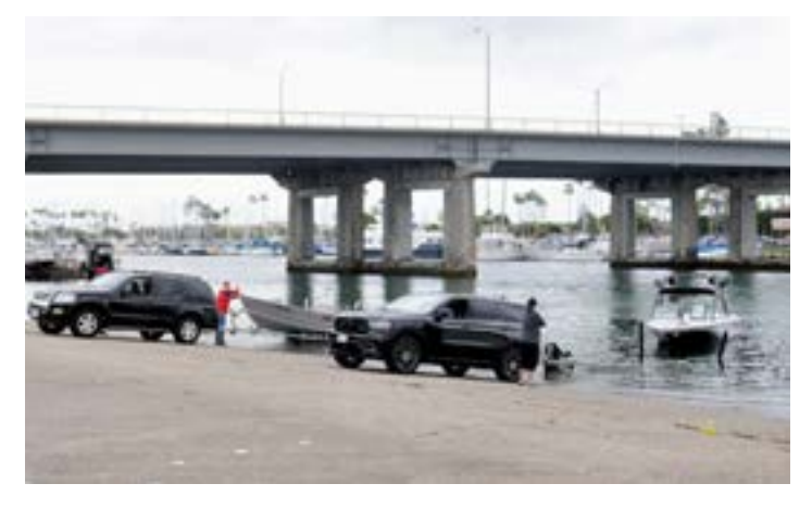
Davies Launch Ramp, shown here will receive an improvement grant of $300,000. So as not to risk grant funding opportunities, the private use practice of "First Right of Refusal" will not be reinsated.

The focus of this months' letter is the former practice known as "First Right of Refusal". The practice gave yacht club members priority slip assignments. With the reconstruction of the Alamitos Bay Marina, the practice was ceased per the requirements of the State's Division of Boating and Waterways (DBW), Publicly Owned Marina Loan Agreements. Upon issuance of the 2015 Marina Revenue Bonds, DBW loans were paid in full. The City was approached by the yacht clubs in an effort to reintroduce the practice.