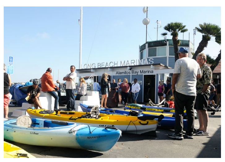
Prospective bidders check out the items on offer. .

The Long Beach Marine Bureau will be holding an auction of impounded and abandoned vessels on November 10th at the Alamitos Bay Marina Office, 205 N. Marina Drive, Long Beach, CA 90803. Inspection and registration begins at 8AM and the bidding begins at 9AM.