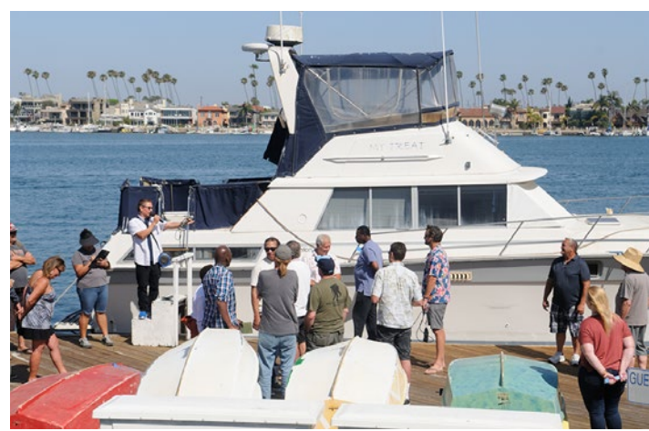
A wide array of vessels are available at the auction.

All items offered "As Is – Where Is." All sales are final. There will be no refunds or adjustments. There is no warranty either specific or implied as to the condition of the items offered for sale and we reserve the right to reject any offer or withdraw any item from the sale.