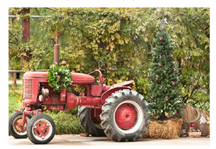
Holiday celebrations take place at Rancho Los Cerritos on December 9th.

Here are some of the events going on in Long Beach this December to put you in the holiday spirit.