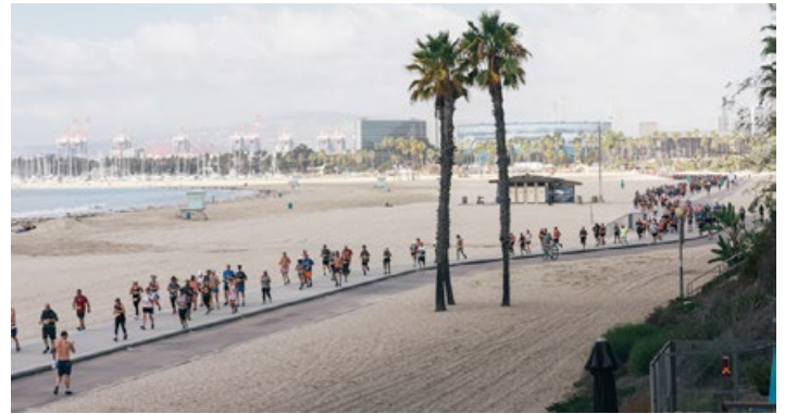
Over 25,000 individuals will take part in Long Beach Marathon events which take part over the weekend of October 12-13.